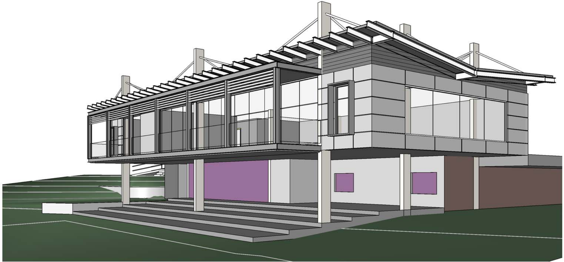
view looking at south west face