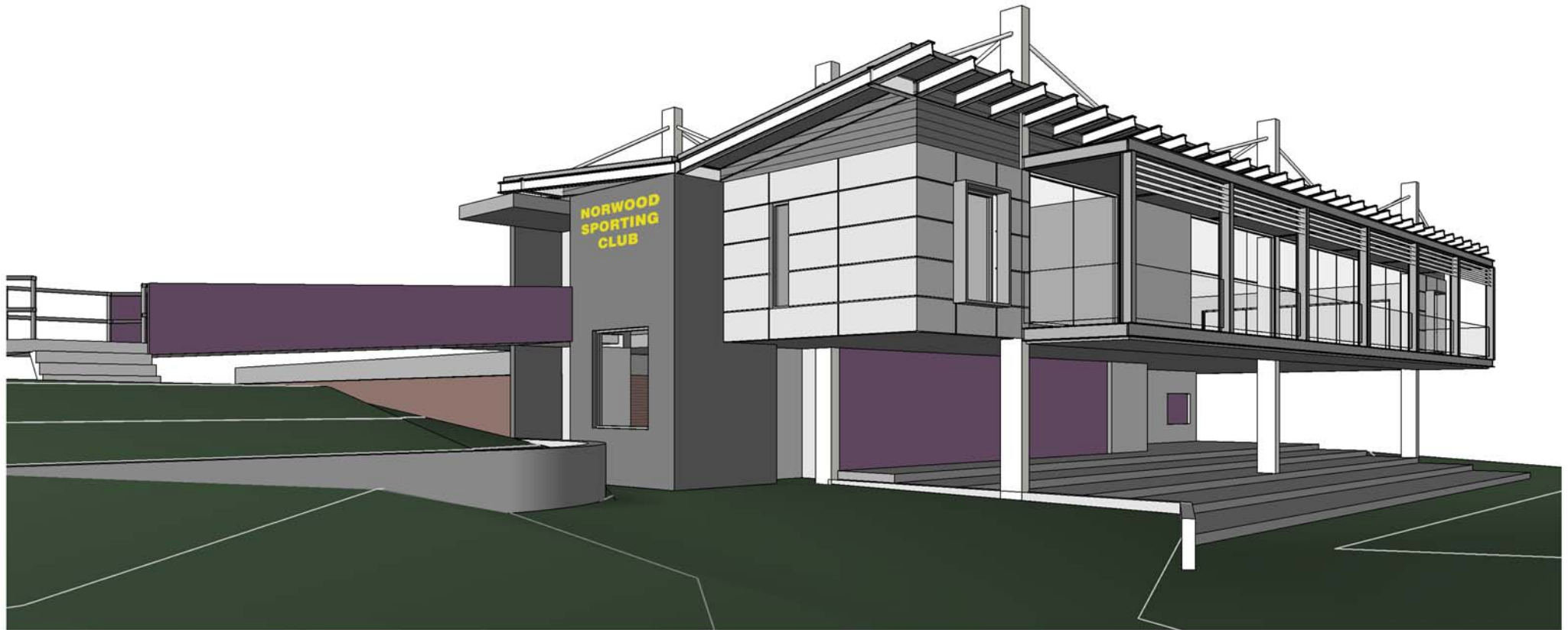
view looking at north west face