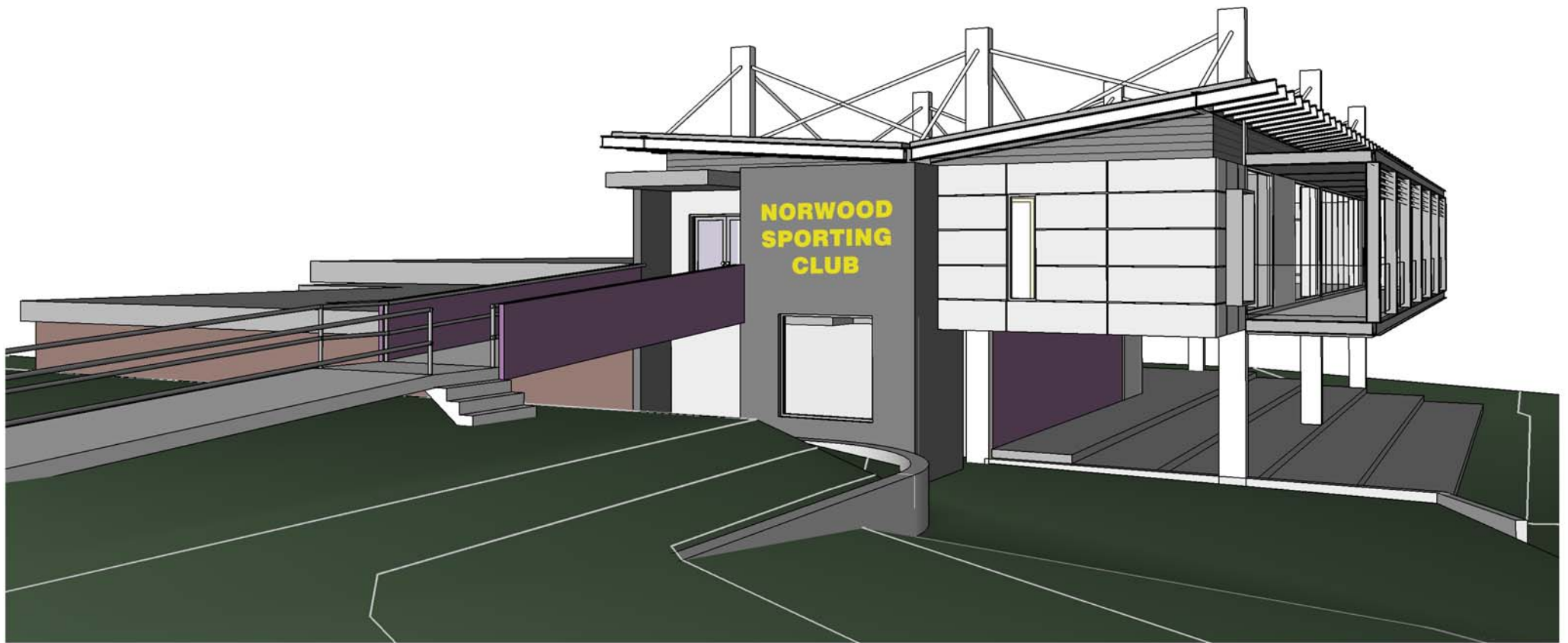
view looking at north face